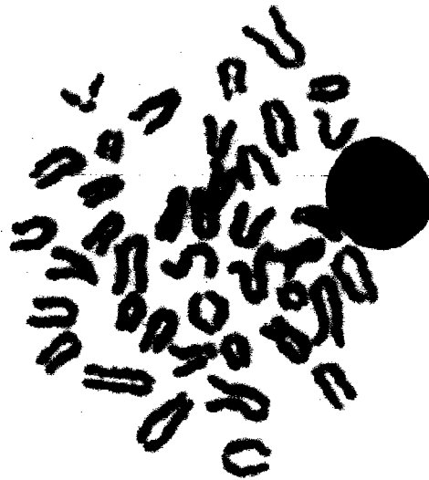
Fig 2: Metaphase spread – Mice (Negative control – Distilled water)

100 metaphase spreads were scored per each sample. Each value is the mean of 10 samples. SE is the standard error of the mean; SEV is the statistical evaluation obtained following ANOVA test and subsequent comparing with Duncan's new multiple range test. Values in vertical column (Mean \pm SE) followed by the same letter (a,a) are not significantly different at 5% level whereas values with different letters (a,b) are significant at 5% level.