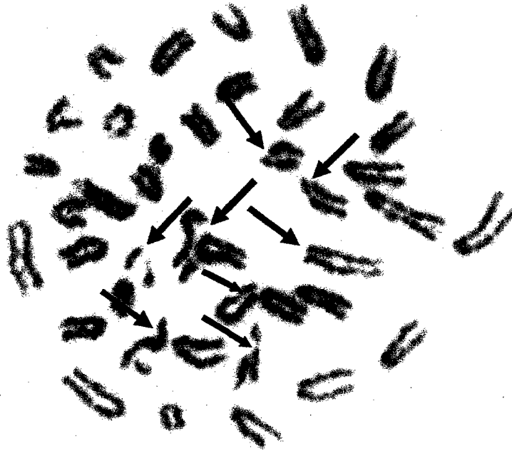
Fig 4. Metaphase spread – Mice (Positive control - Mitomycin C)