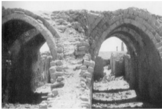
Fig 2.1: Ruins of earth shelters (Egyptian mud-brick storage rooms, 3200 years) (Middendorf, 2001)

From the past to the present day, earth seems to be the material of choice. Mud brick that was made of alluvial soils were mixed with cereal straws. It gave man his first durable construction material and took many forms, such as adobe, rammed earth and straw-clay (Houben & Guillaud, 1994; Smith, 2004). Earth architecture has also deep roots in all old civilizations, the Middle East, Iran and the cradle of the Sumerian civilization in Iraq (Fig. 2.1). At Shibam in South of Yemen, there are more than ten stories high of cob buildings (Houben & Guillaud, 1994). Nowadays, unbaked earth buildings shelter about thirty percent of the world's population (Houben & Guillaud, 1994; Middfort, 2001; Megyesi, 2003).