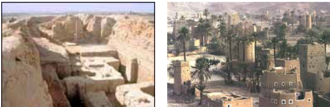
Fig. 1.3: Egyptian mud-brick storage rooms (3200 years old) (CRATerre-EAG) and cob buildings in Sa'dah, Yemen (Marechaux, 1998)

Adobe has a great heritage of sustainable clay buildings around the world and has special experts in this area. The adobe block follows the heritage of the traditional architecture of numerous countries using local materials (Little & Morton, 2001) (Fig. 1.3). In some wet and humid areas where unburned bricks are used, roofs are designed to shade the mud wall. This means that the building is only one or two stories high. These places have cheap wood for the roofs. Wood is usually very expensive in many countries, and is not suitable for low-cost houses (Middendorf, 2001). In Yemen (for example), the biggest problem in the unburned clay buildings is the water effect and the brick strength (Lewcock, 1986).