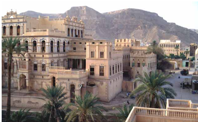
Fig. 1.2: Example from Yemen. Mud clay ancient palace, Tarim city (Bradley, 1997)

Actually, most developing countries are facing a real housing deficiency (Harison & Sinha, 1995). Therefore, there is an urgent need to construct and build houses that are more durable at a low cost. In this regard, clay masonry has a long and illustrious record of providing durable and attractive buildings (Fig.1.2). Recently, the technology of traditional earth construction has undergone considerable developments that have enhanced earth's durability and quality as a construction material for low-cost buildings (Adam & Agib, 2001).