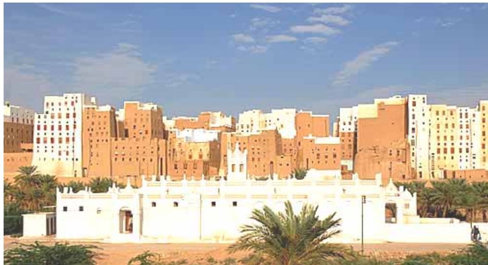
Fig. 1.4: Shibam, city in Wadi Hadhramout/Yemen (Doan, 2007)