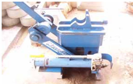
Fig. 1.6: The CINVA-Ram hydraulic compressed machine

Compressed earth blocks are made by using a variety of machines. Some, like the CINVA-Ram were invented for compressing earth blocks (Fig. 1.6). Compressed earth block technology offers an alternative kind of building construction which is more accessible and of high quality. The compressed earth block is one of the most important "modern building materials" which has enough production flexibility to let it be integrated into both formal and informal sectors of structural activities (Rigassi, 1995). Some hydraulic machines were developed to get blocks similar to concrete blocks (Bahar et al., 2004).