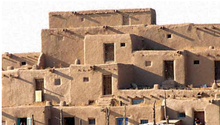
Fig. 1.5: Clay buildings in New Mexico. Adobe is the most traditional form of earthen construction in the US (Blanc)

In industrial countries such as in the Southwest U.S.A, the very rich class often uses adobe, while in "developing" countries; its use is mostly confined to those who are too poor to have access to other building materials. Adobe is appropriate in areas, which are labor-rich and capital-poor; because it is labor intensive, using local materials and simple tools (Kennedy, 1997). Fig. 1.5 is an example of its wide appeal.